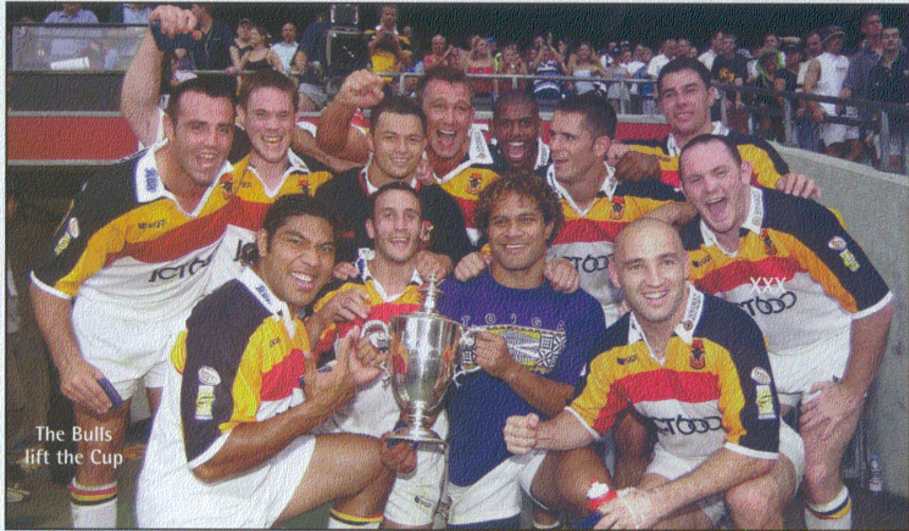
The Bulls lift the Cup